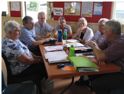
7 Tables of Think Tankers