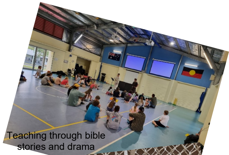
Teaching through bible stories and drama