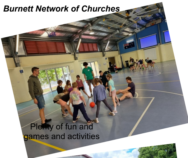
Plenty of fun and games and activities