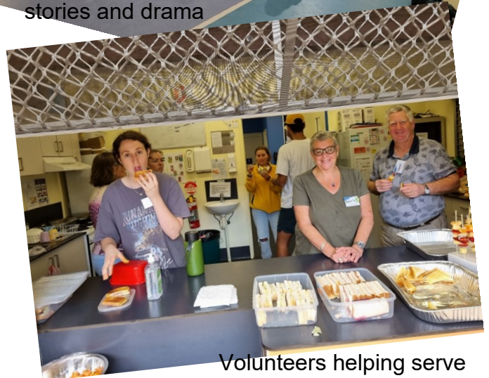
Volunteers helping serve the hungry