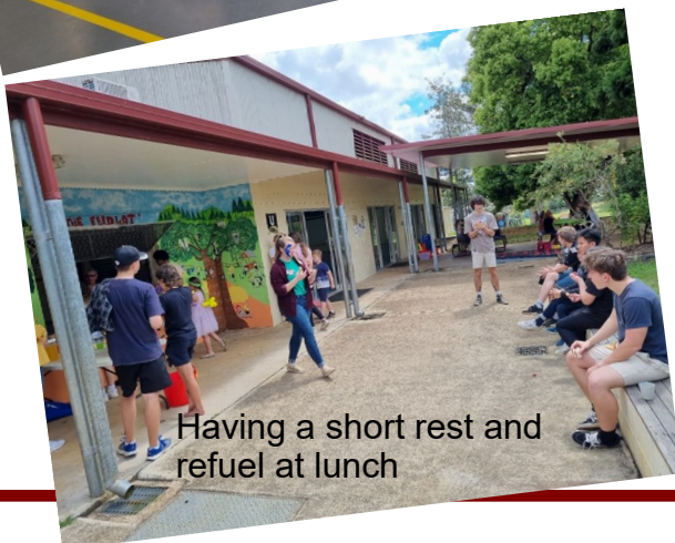
Having a short rest and refuel at lunch